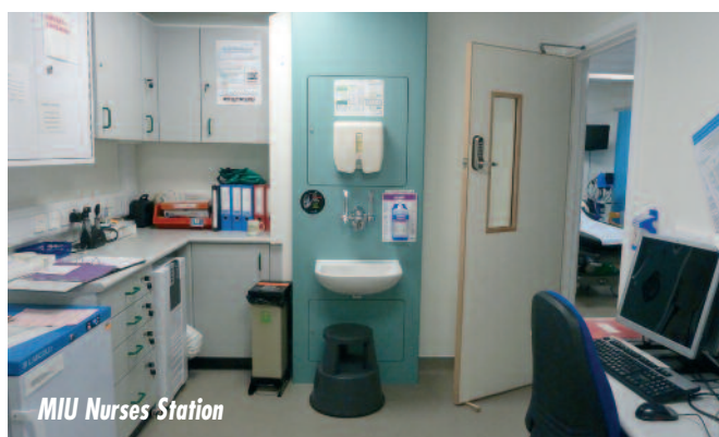
MIU Nurses Station

Our most sincere thanks go to Nicci Brown and the Forum Focus magazine for assistance with this piece and for allowing us to use their photographs in addition to our own.