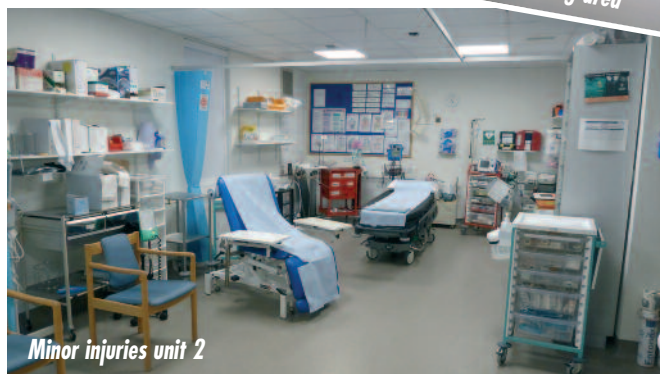
Minor injuries unit 2