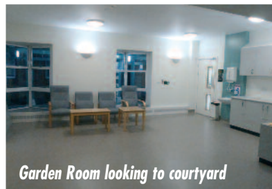
Garden Room looking to courtyard