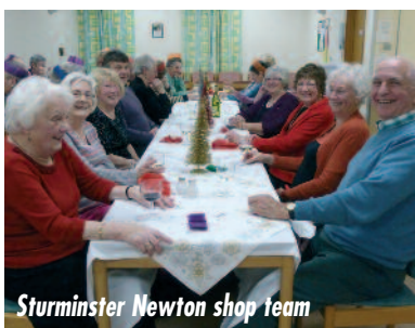
Sturminster Newton shop team

In January we held our annual team dinners to take the opportunity to bring everybody together and thank them properly. These were most enjoyable evenings amongst great company with scrumptious food provided by the wonderful kitchen team here at the hospital.