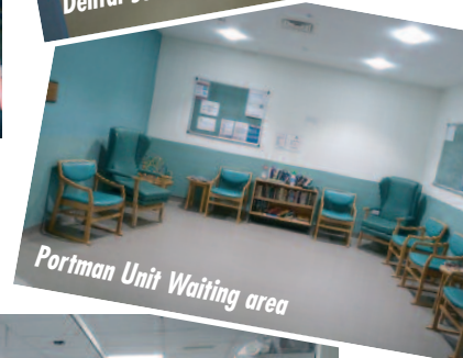
Portman Unit Waiting area