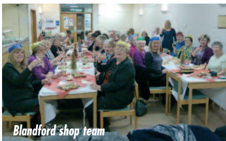
Blandford shop team

We are very proud of our charity shops and the teams of volunteers that work so hard to make them such a success. The volunteers love what they do and make the shops such friendly places to work and shop.