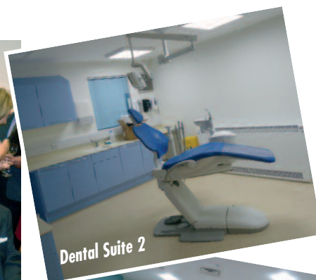
Dental Suite 2