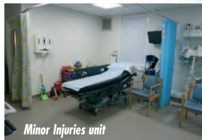
Minor Injuries unit