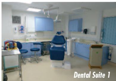
Dental Suite 1