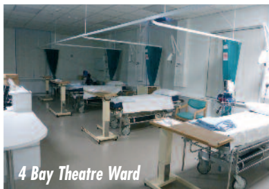
4 Bay Theatre Ward