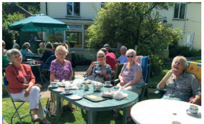
Sturminster Newton Team