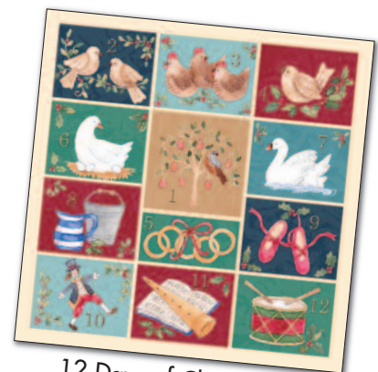
12 Days of Christmas

Please return this order slip to the Friends of Blandford Community Hospital, Milldown Road, Blandford Forum, Dorset DT11 7DD.