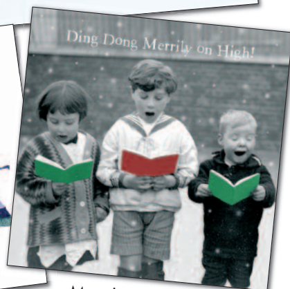
Merrily on High!

Please send me Christmas Cards as detailed below @ £2.80 per pack (or 4 packs for £10.00) plus £1.00 per order towards packaging and delivery. I am pleased to enclose my cheque for £_____. (Cheques should be made payable to "Friends of Blandford Hospital")