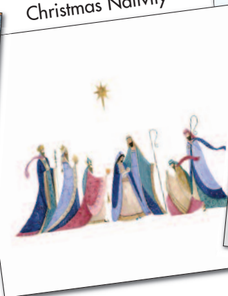
Ding Dong Merrily on High!