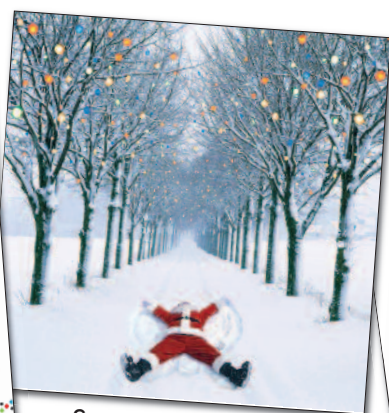
Santa Snow Angel